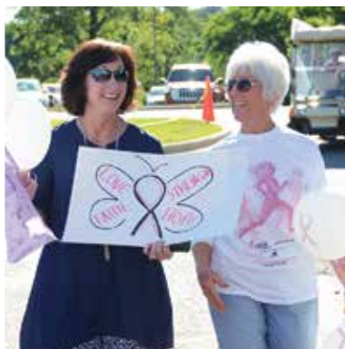
PCSH Supporting One Another