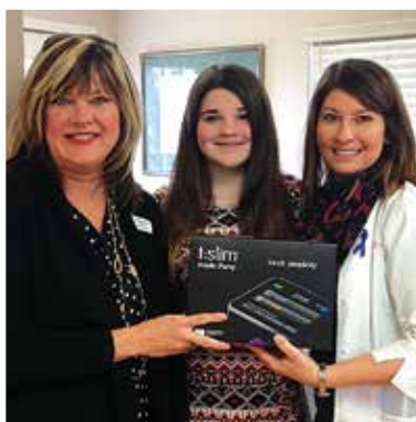
RDLC Offers New Solutions for Diabetics