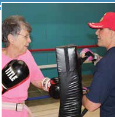
MFECOA Rock Steady Boxing

The majority of services provided at the Mruk Family Education Center on Aging are free of charge. For more information, please call 870-508-3880.