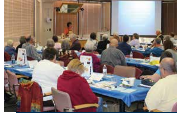
World Diabetes Day Program

The Peitz Cancer Support House held four successful fundraisers during 2016 including Pink Out Football and Dining for a Cause. One project that includes furry family members is an annual pet contest, with the top 12 finalists photographed for the Paws for the Cause calendar. Funds are raised from entry fees, votes for the pets, numerous sponsorships and calendar sales. A total of $11,181 was raised in 2016 from the calendar project and 100% of the proceeds stay right here in our community and benefit the Peitz Cancer Support House.