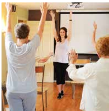
SCWHE - Supporting Women of All Ages