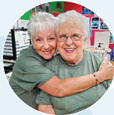
MFECO A Rock Steady Boxing