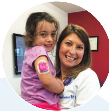
RDLC Teaching Our Youngest Clients

The RDLC truly cares about the success of each and every diabetes patient. Please call 870-508-1765 for more info.