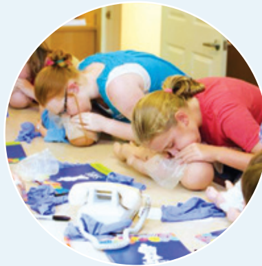
SCWHE Safe Sitter Classes