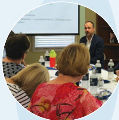
PCSH Offers Numerous Classes