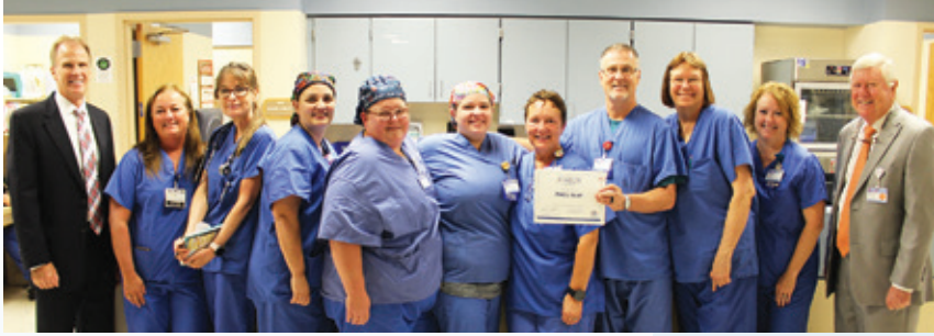
Team Members Honored as Heroes with Halos in 2019